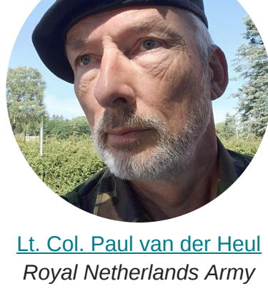
Lt. Col. Paul van der Heul Royal Netherlands Army